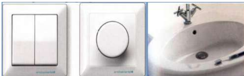
Fig. 4. A-Contact surfaces such as light switches, door grips and handles are typical germ accumulators. An antibacterial material, such as that used for this light switch, can prevent germs spreading. b- Nanoscalar silver particles contained in the glaze applied to ceramic sanitary installations lend it antibacterial properties 21 .