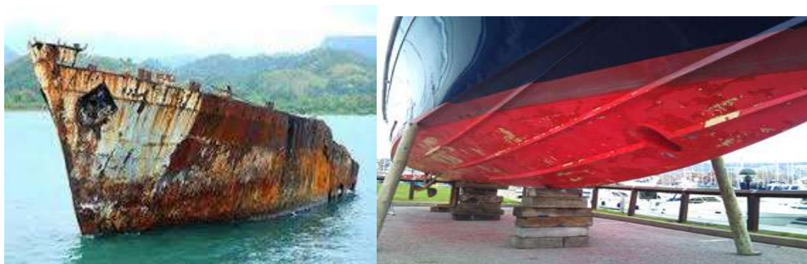
Figure 6 Antifouling coating using nanomaterials. http://nanotechmarine.com/new-nanotech-antifouling-40-c.asp