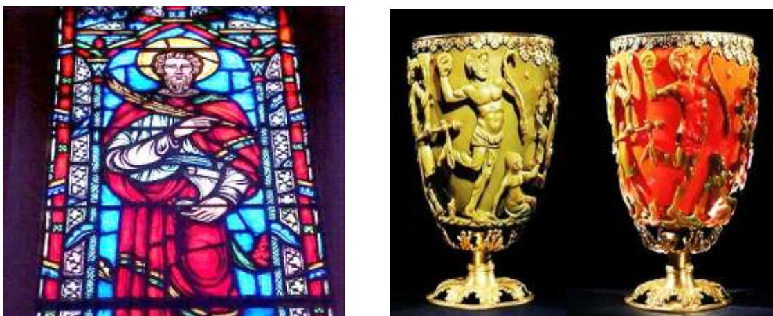
Figure.2.Ancient church Paints using nanotechnology( http://www.ancient-origins.net/news-science-space-ancient-technology/roman-nanotechnology-inspires-holograms 102783#sthash.LOZtKY0J.dpuf)

Nanotechnology is said to be present in anything from stained glass in Medieval European churches to blades of eighteenth century Indian warriors(as shown in Fig.2).The drinking cup, depicting King Lycurgus of Trace, has a green color when lit from the front. But when held against the light, the glass suddenly changes color and turns red. This feature has long puzzled researchers but is now explained by the presence of golden and silver nanoparticles that alter the color of the glass depending on the position of the observer in relation to the light The vast majority of nanotech consumer products on the market today make use of interface effects.