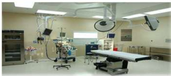
Figure 5 Antimicrobial wall coating containing nano sized silver particles for use in clinics and hospitals

Then, to act as a biocide, Ag + ions need to be released which requires water to actually dissolve the ions. Bioni CS GmbH produces Bioni Hygienic (Figure 5), a fungi- and bactericidal interior wall paint that is claimed to permanently destroy even the most resistant of hospital germs and bacteria without contaminating the air inside the building ( http://www.bioni.de/index.php?lang=en ).