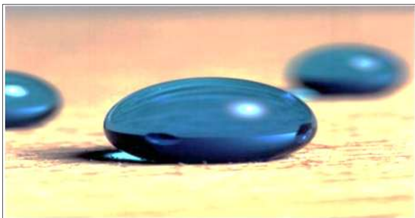
Figure 3: A hydrophobic wooden surface.

surface with a contact angle of 180^\circ , for example, has been achieved by a vertically grown Teflon coated nanotube forest 15, 18-19 .